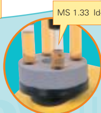
MS 1.33 Id-Nr. L001860

No pre-drilled holes. Any number of holes may be drilled.