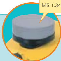
MS 1.34 Id-Nr. L001830