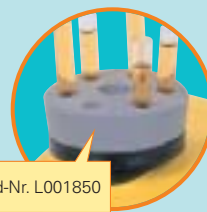
MS 1.32 Id-Nr. L001850